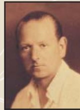
Dr. Edward Bach, 1930

'Health is our heritage, our right. It is the complete and full union between soul, mind and body; and this is no difficult far-away ideal to attain, but one so easy and natural that many of us have overlooked it.'